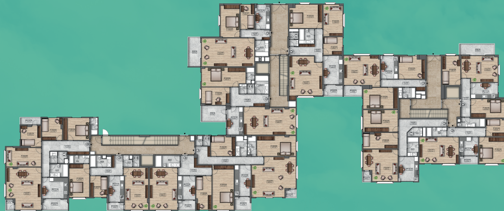
1 st BASEMENT FLOOR PLAN