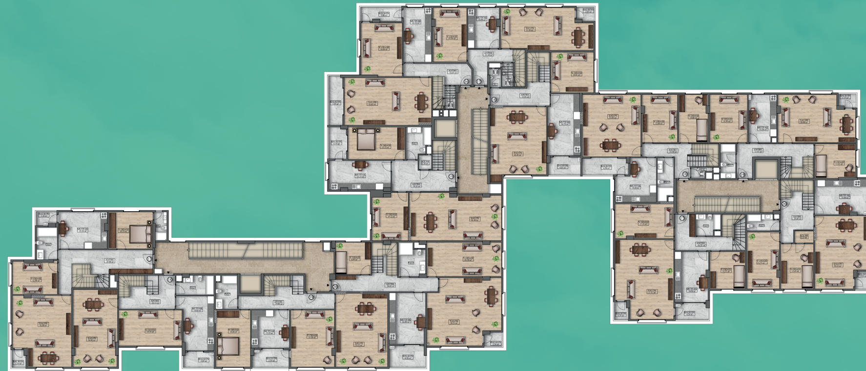
4 th NORMAL FLOOR PLAN