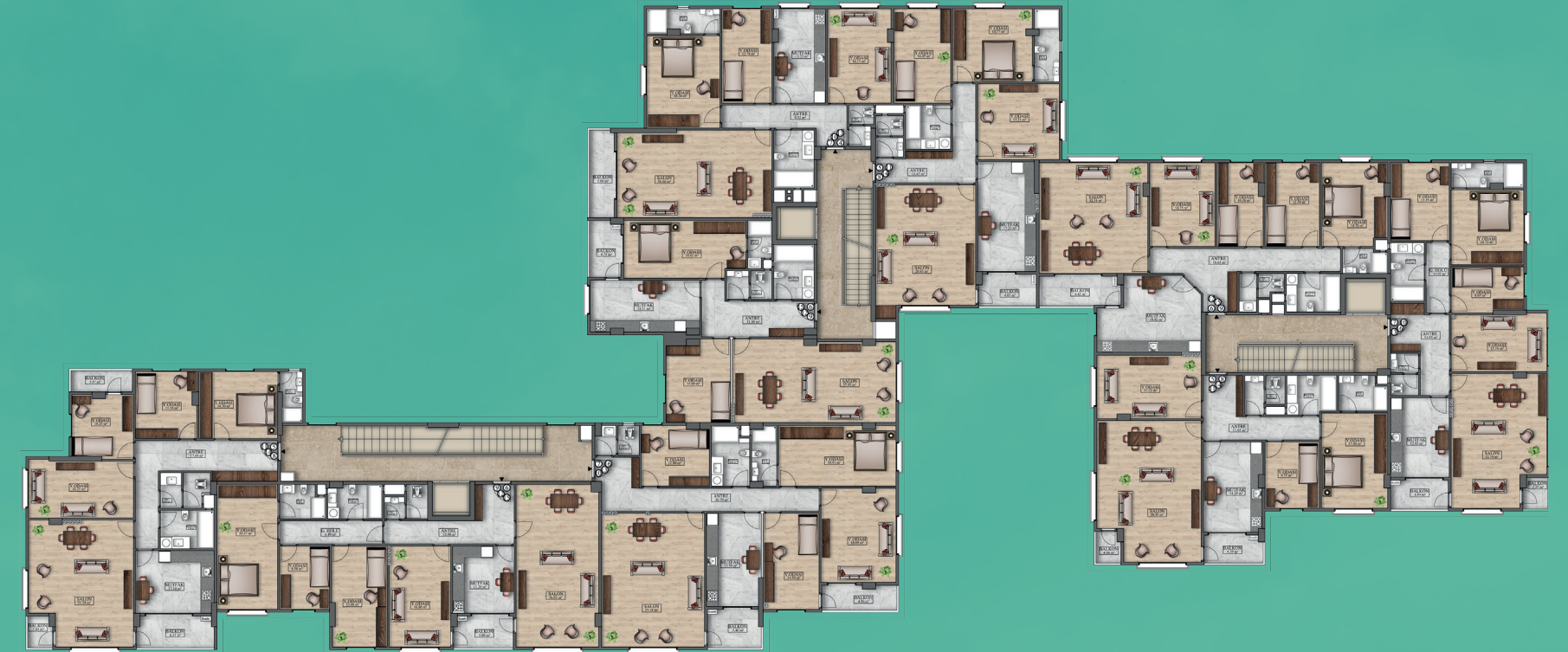
BASEMENT-1-2-3. NORMAL FLOOR PLAN